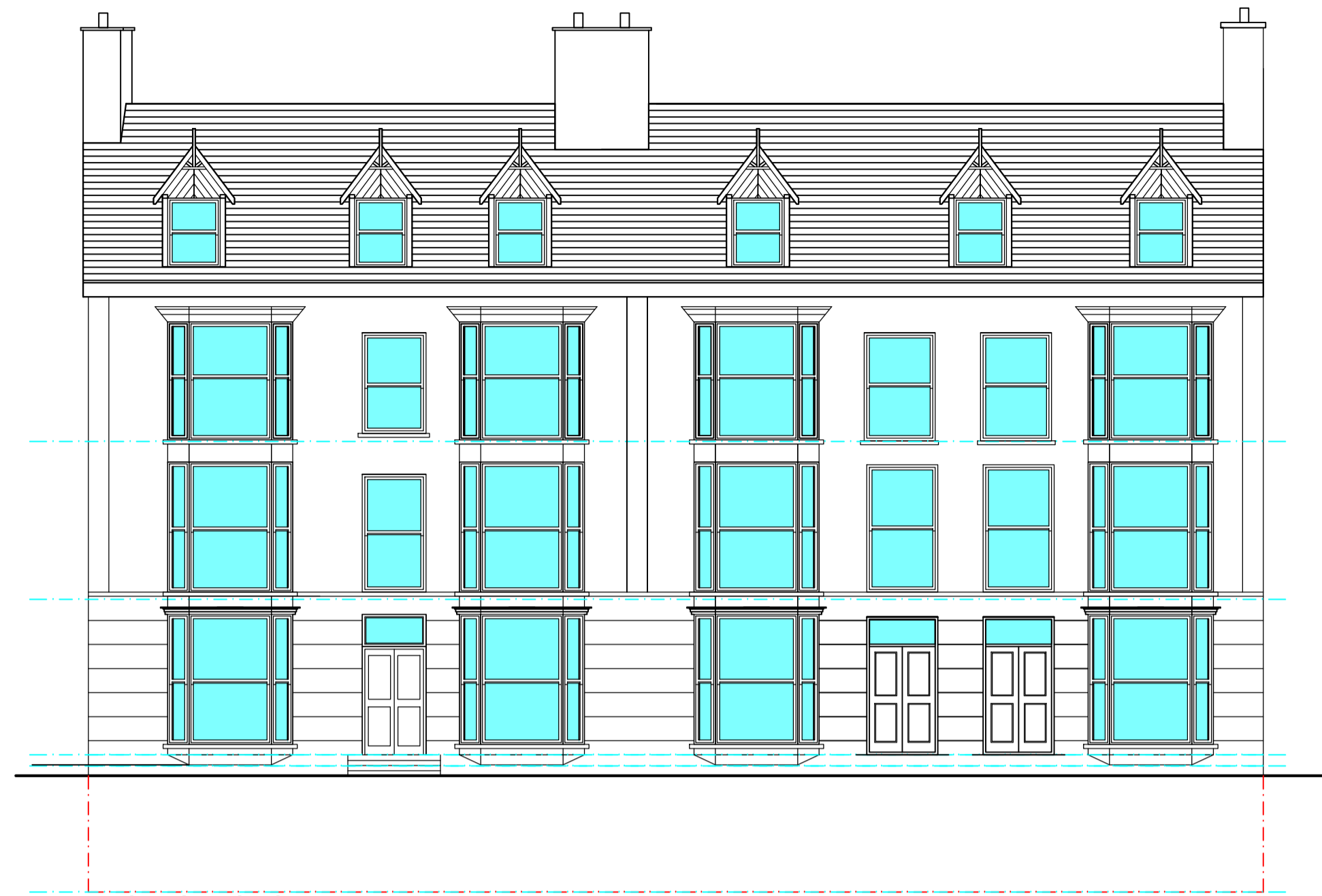
Edrychiad Blaen Front Elevation